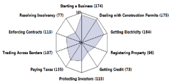
Figure 2: BiH's ranking according to Doing Business indicators:

entities, the process of company registration in FBiH will be simplified and reduced to five days. This will happen almost simultaneously with the same process taking place in the RS. According to the new legislation, courts shall issue registration decisions within five days, while the tax identification number shall be issued within three days. The number of documents delivered to courts when registering a company or altering the status of an existing company is also reduced. These modifications constitute a step forward in the implementation of e-government and e-business projects, yet this is still a far cry from registration procedures as they are implemented in the EU or the BRIS system. 11 Legislation in BiH, until 2012, did not undergo significant modification; however the efficiency in implementation of legislation was improved. Consequently, in terms of issues of starting a business and doing business (ease of doing business), BiH was ranked 110th out of 183 national economies in 2012; in 2013 BiH was ranked 130th, and we are looking at being ranked 131st out of 189 world economies in 2014. 12 The plunge down the ranking list is not necessarily the result of absence of implementation of legislation or lack of progress; rather, to a large degree, this is due to the fact that the other analysed countries are making swifter progress in terms of adoption and implementation of legislation and economic reforms.